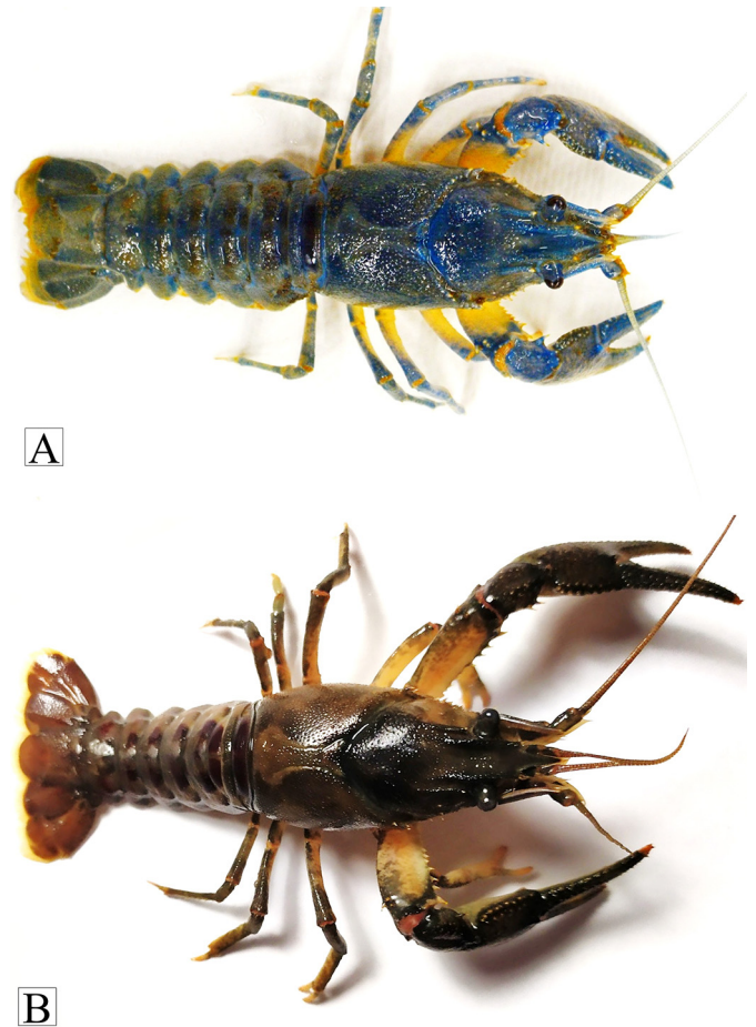
Fig. 3. Neighbour-Joining tree for blue Faxonius limosus and GenBank-stored sequences.

Collected specimens were identified as representatives of F. limosus . Taxonomic affiliation to the species was confirmed by the DNA Standard Barcoding procedure study. Moreover, all the studied individuals represented only one haplotype (both blue specimens as well as the sequences taken from