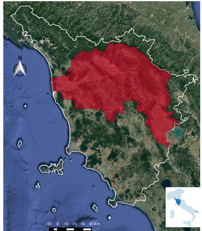
Fig. 1. Study area: the Arno basin in Tuscany (in red) and the Tuscany region in Italy (blue).

To date, various human dimension studies have explored the role of recreational anglers in biological invasions, as human behaviour is a major source of uncertainty in fisheries and in the management of IAS (Fulton et al. , 2011; Hunt et al. , 2013). However, most of these works focused on at risk-behaviours which can lead to accidental introduction of aquatic IAS, like improper bait disposal or equipment cleaning (Gates et al. , 2009; Seekamp et al. , 2016), or on the potential effect of information provisioning and normative change as tools to prevent them (Azevedo-Santos et al. , 2015; Howell et al. , 2015; Pradhananga et al. , 2015; Fujitani et al. , 2016). On the other hand, fewer studies addressed drivers of deliberate fish introductions (Drake et al. , 2015), especially for Mediterranean Europe (Banha et al. , 2017a). This research gap must be addressed, as deliberate angling is responsible for the arrival of many invasive alien fish species in Mediterranean freshwater (Gherardi et al. , 2008), including some major ecosystem engineers, like Silurus glanis (Carol et al. , 2009; Copp et al. , 2009), Cyprinus carpio (Vilizzi, 2012; Vilizzi et al. , 2015), Micropterus salmoides (Garcia-Berthou et al. , 2000) and Zander lucioperca (Lorenzoni et al. , 2006; Kopp et al. , 2009),